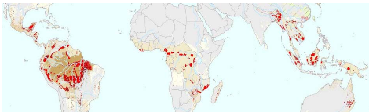
Figure 1: World areas where deforestation is occurring. Areas in red show the main active deforestation fronts

The degradation of tropical forests is a related issue that also has major impacts on climate and biodiversity. Degradation takes different forms, is difficult to define 4 and is not always accurately measurable. Although it cannot be treated in the same way as deforestation, it must be addressed if any strategic approach on forests is to be coherent and comprehensive.